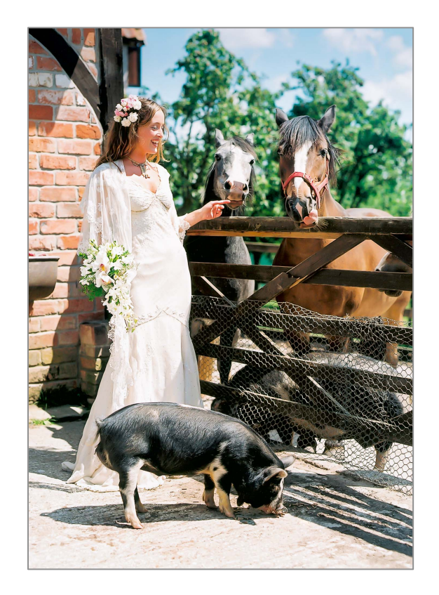
ALICE TEMPERLEY BRITISH VOGUE